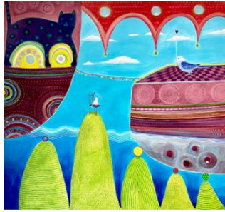
A Cat's Dream, 30" x 30" acrylic on canvas.

"I have been a freelance illustrator and ceramic artist for many years, and recently began painting in acrylics again. Images that are dear to me, such as cats, dogs, birds, and the spaces we call home, present themselves in my art. Painting the whimsical side of life brings me joy.